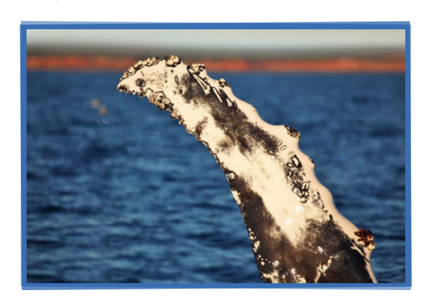
Total number of individual whales recorded within 4.5 km, 8 km & 11.5 km of the shore