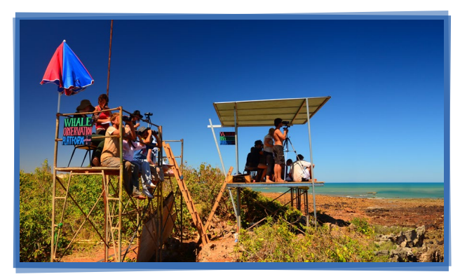
The observation platforms at Murdudun