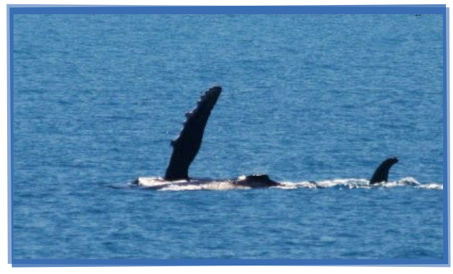
The Humpback Whale (Megaptera novaeangliae), Mother and calf near the shores of James Price Point